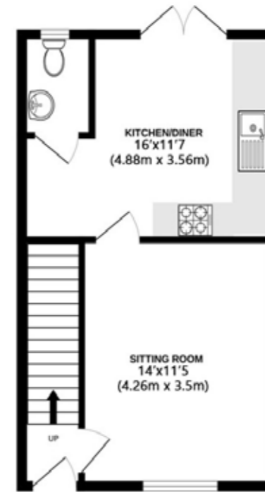
GROUND FLOOR 371 sq.ft. (34.5 sq.m.) approx.