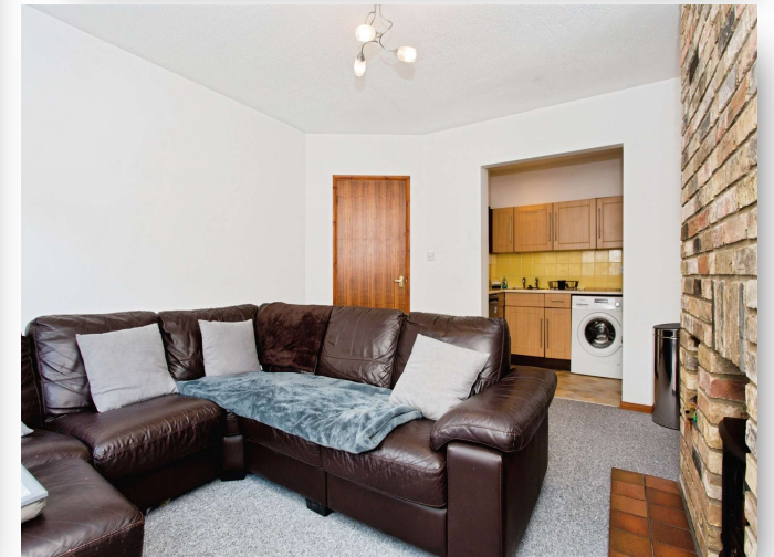
9 Beagle Court, Cottenham, Cambridge, CB24 8RS