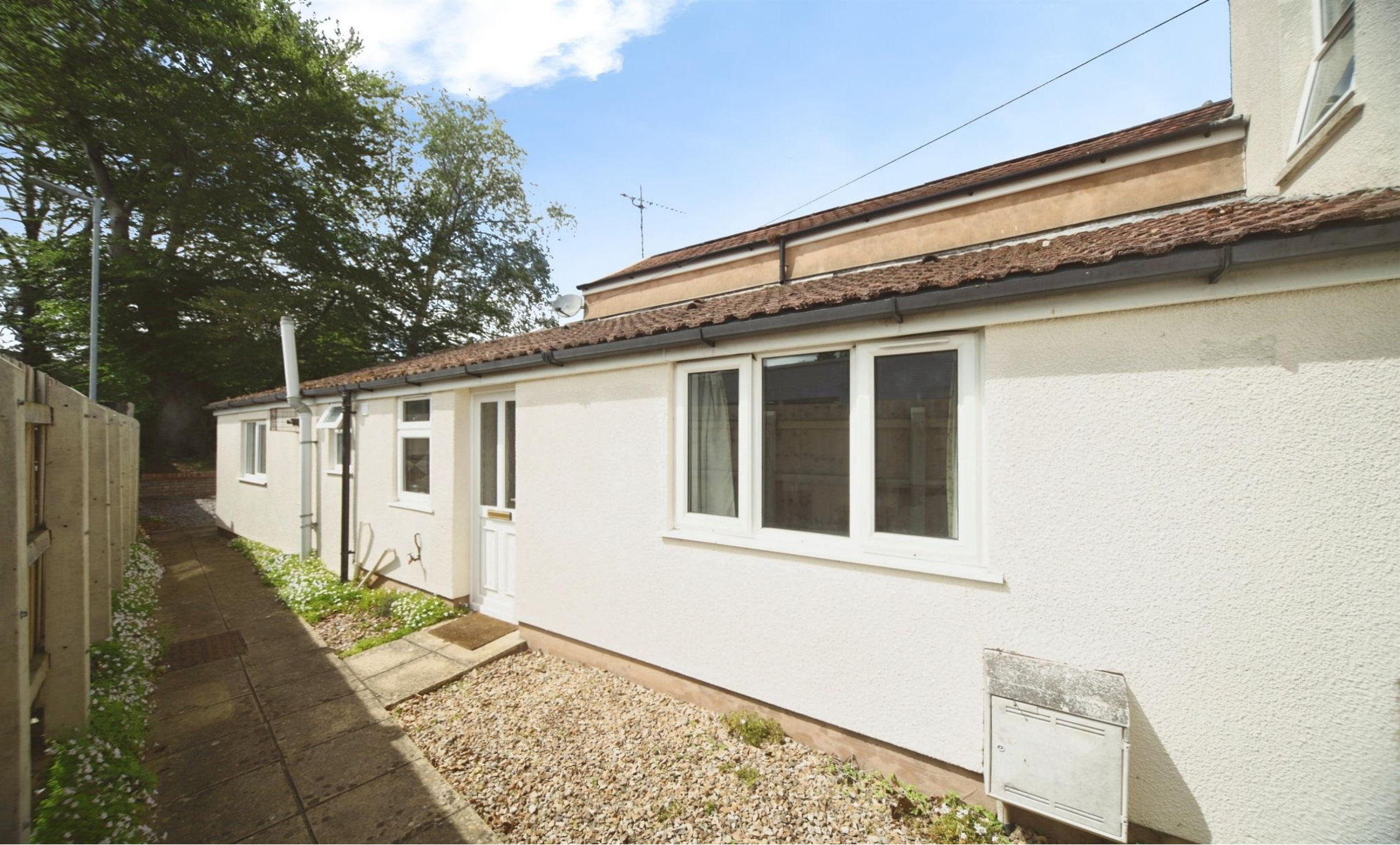
Silver Street, Taunton TA1 3DL