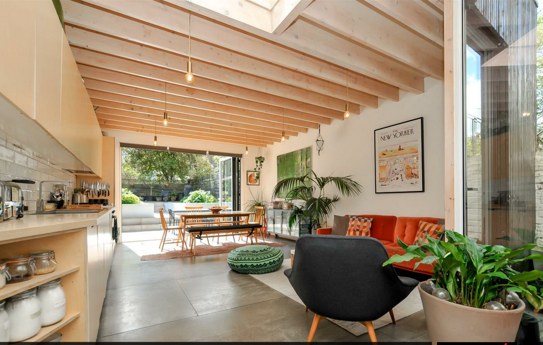
Amhurst Road Stoke Newington, N16