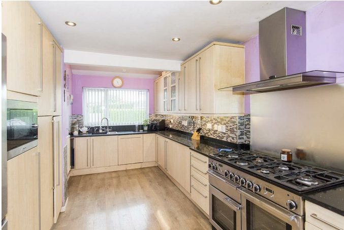
Dining Kitchen 24'5 x 7'10 (7.44m x 2.39m)

Fitted with a wide range of cabinets with granite surfaces over, composite under-mounted sink with mixer taps. The kitchen benefits from a Rangemaster oven with a six burner gas hob and extractor canopy over. There is an integrated dishwasher and space for a fridge freezer. A window to the front aspect as well as a Velux window. A side door that gives access to the drive.