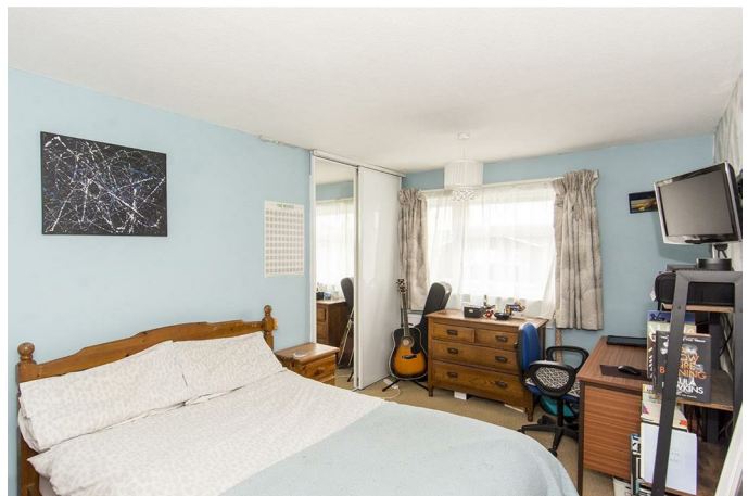
Bedroom Two 9'2" x 13'10" (2.79m x 4.22m)

A double bedroom with mirror fronted sliding wardrobes. A window to the front aspect and a radiator.