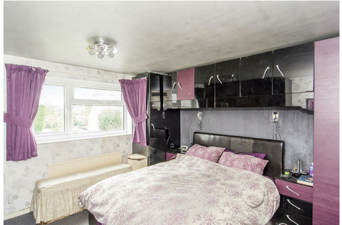
Bedroom One 12'1 x 12'4 (3.68m x 3.76m)

A double bedroom with mirror fronted sliding wardrobes and a window to the rear aspect overlooking the garden and a radiator.