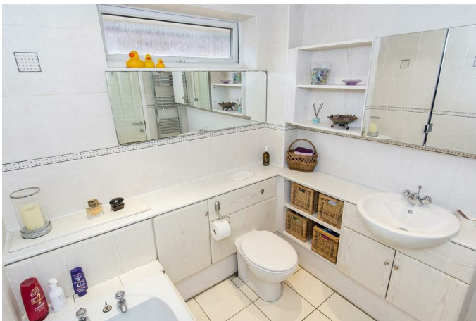
Bathroom 6'11" x 7'0" (2.11m x 2.13m)

Fitted with a back to wall WC. Hand wash basin set onto vanity cupboards. The bath has a shower and side screen. Chrome heated towel rail, ceramic wall and floor tiles. Opaque window to the side aspect.