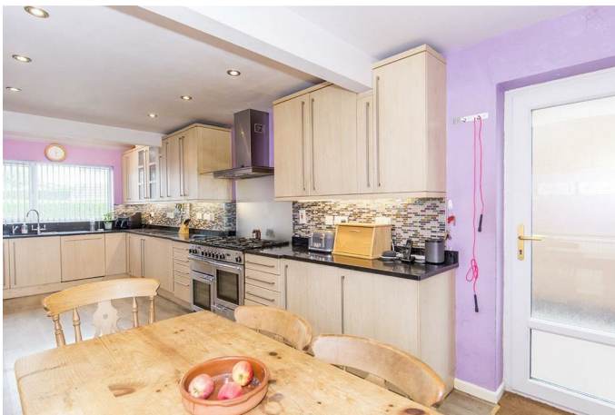
Dining kitchen Photo 2

Fitted with a wide range of cabinets with granite surfaces over, composite under-mounted sink with mixer taps. The kitchen benefits from a Rangemaster oven with a six burner gas hob and extractor canopy over. There is an integrated dishwasher and space for a fridge freezer. A window to the front aspect as well as a Velux window. A side door that gives access to the drive.