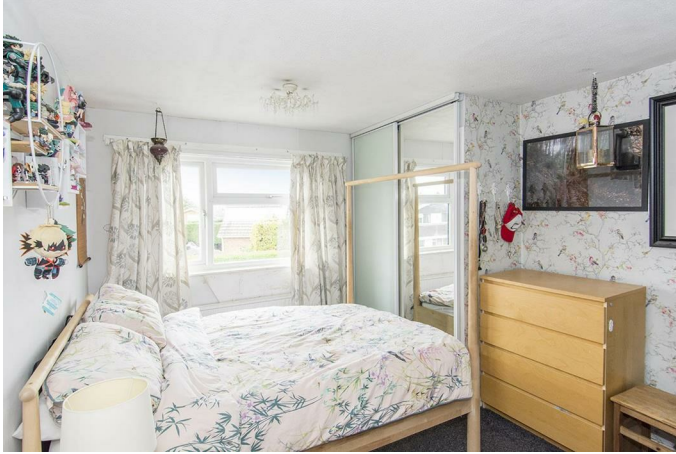
Bedroom Three 10'0" x 11'5" (3.05m x 3.48m)

A double bedroom with mirror fronted sliding wardrobes. A window to the front aspect and a radiator.