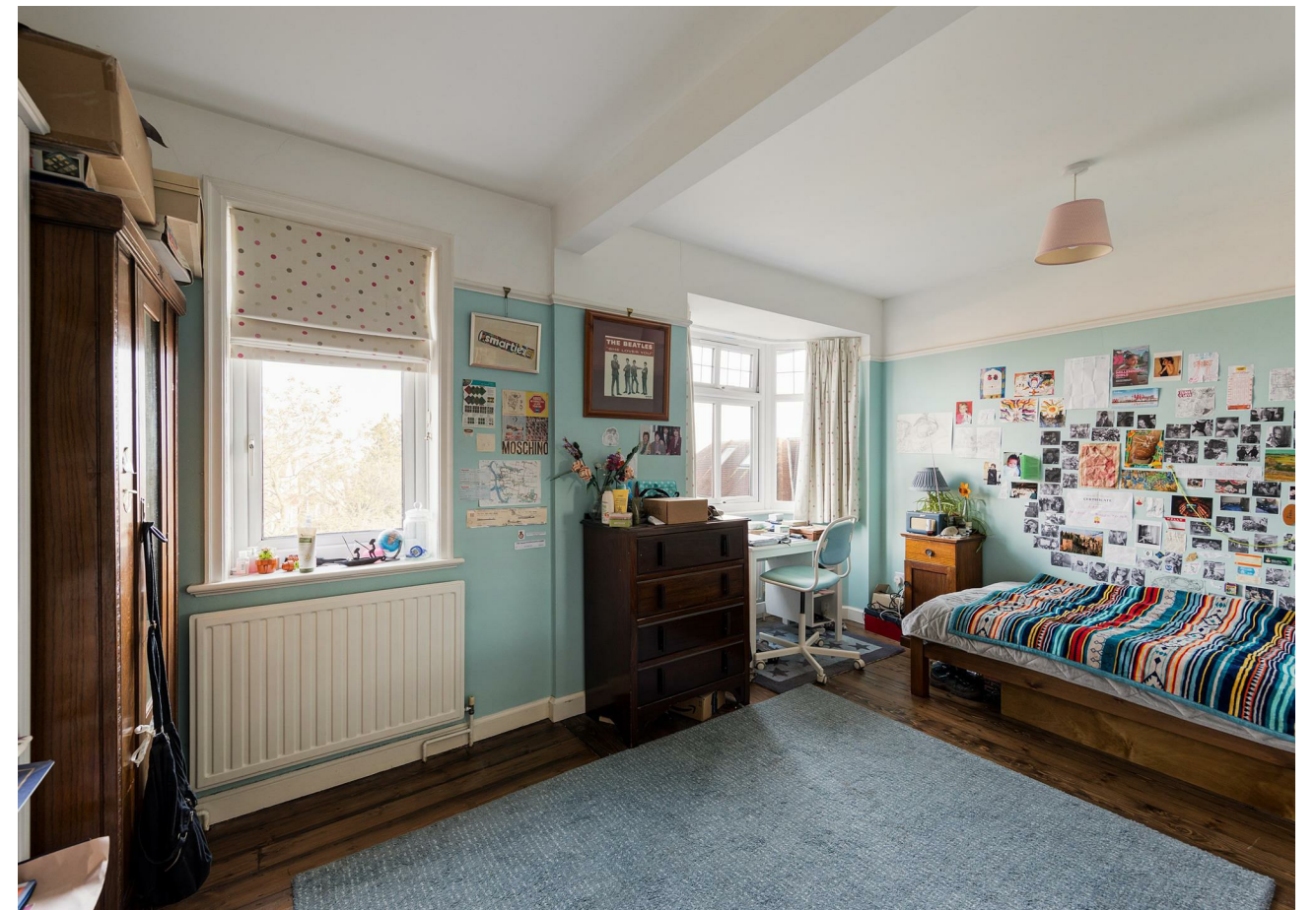
Reception Room 13'1" x 11'3"