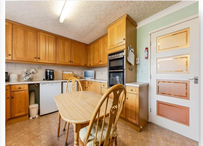
Church Lane, Balderton Newark NG24 3NW