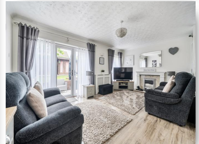
32 Lambourne Drive, Maidenhead SL6 3HG