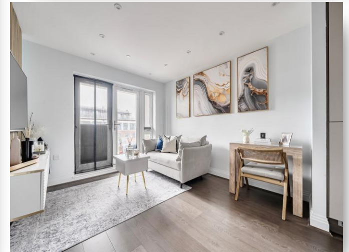
Apartment 75 Waterside Court, The Colonnade, Maidenhead SL6 1DL