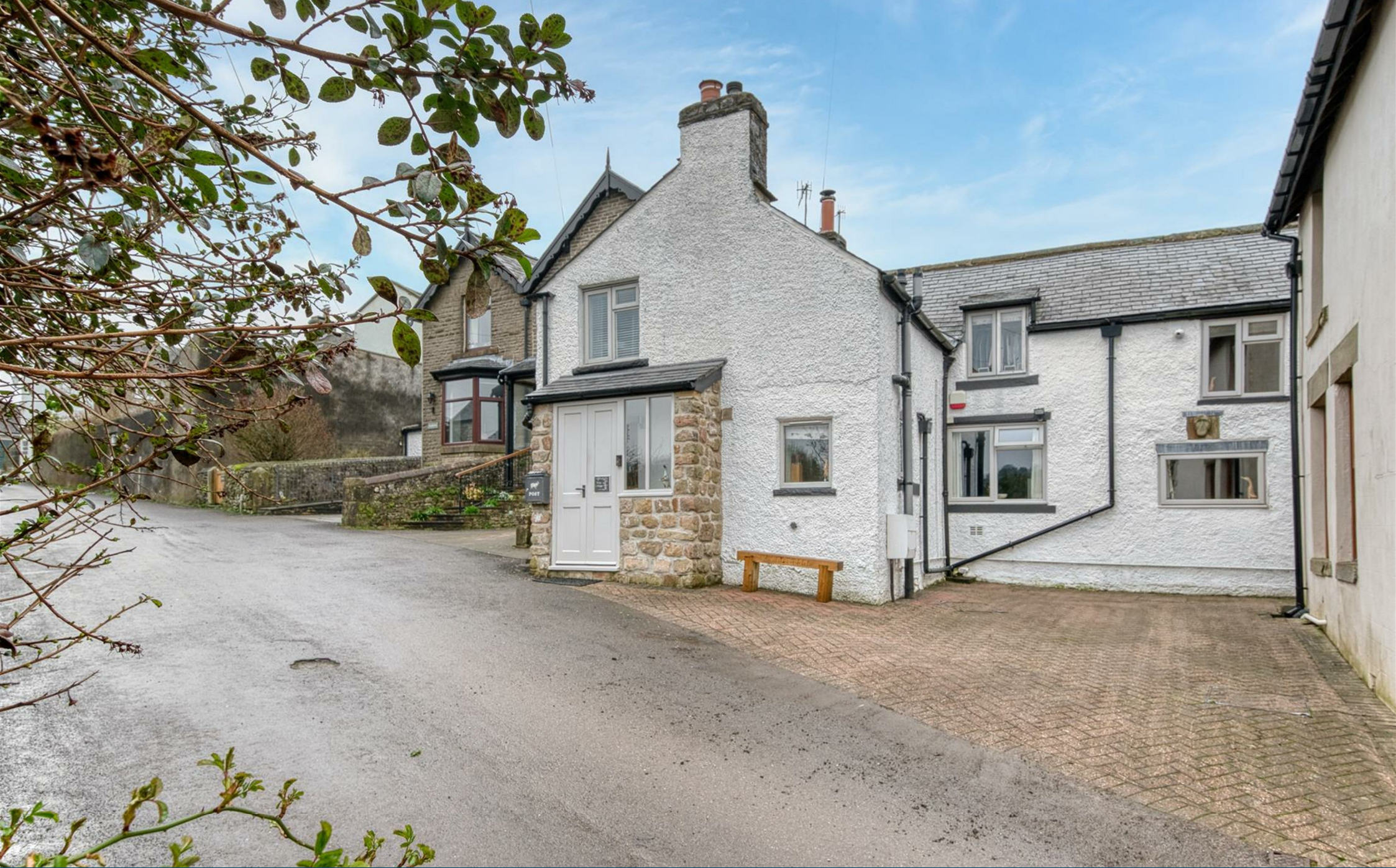
Ivy Cottage, Alma Road, Tideswell, Derbyshire, SK17 8ND