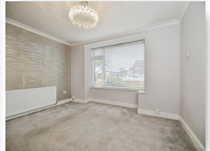
Piper Knowle Road, Stockton-On-Tees TS19 8JF