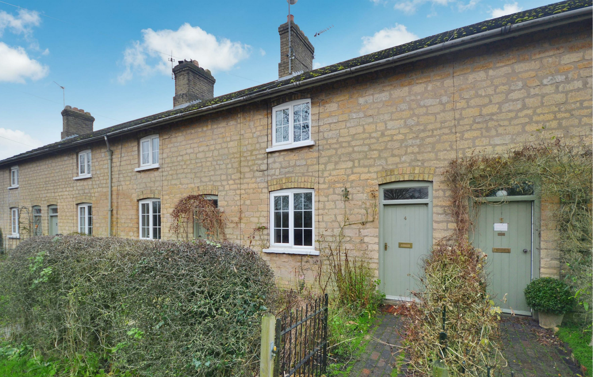
The Row Cold Hanworth