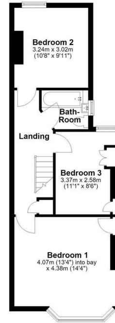
First Floor Approx. 46.3 sq. metres (498.6 sq. feet)