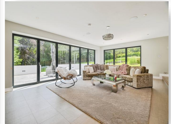
The Grove, Marton-In-Cleveland Middlesbrough TS7 8AF