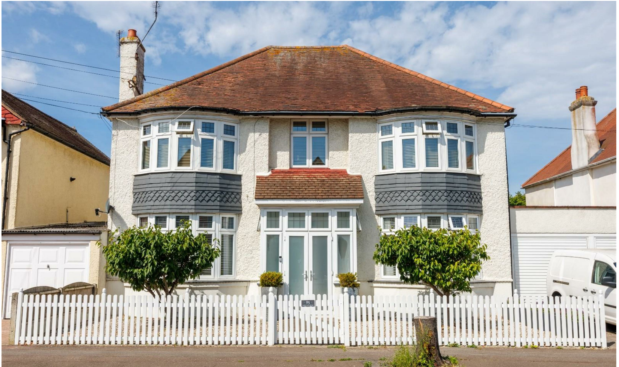
Burnham Road, Leigh-On-Sea Guide Price £650,000