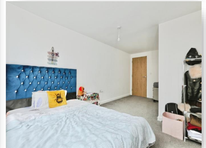
Carolgate House Carolgate, Retford DN22 6DY