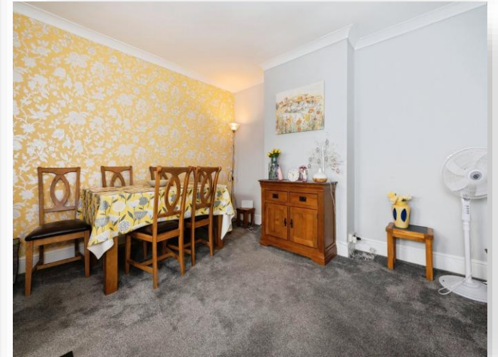
Woodmill Lane, Southampton SO18 2PA