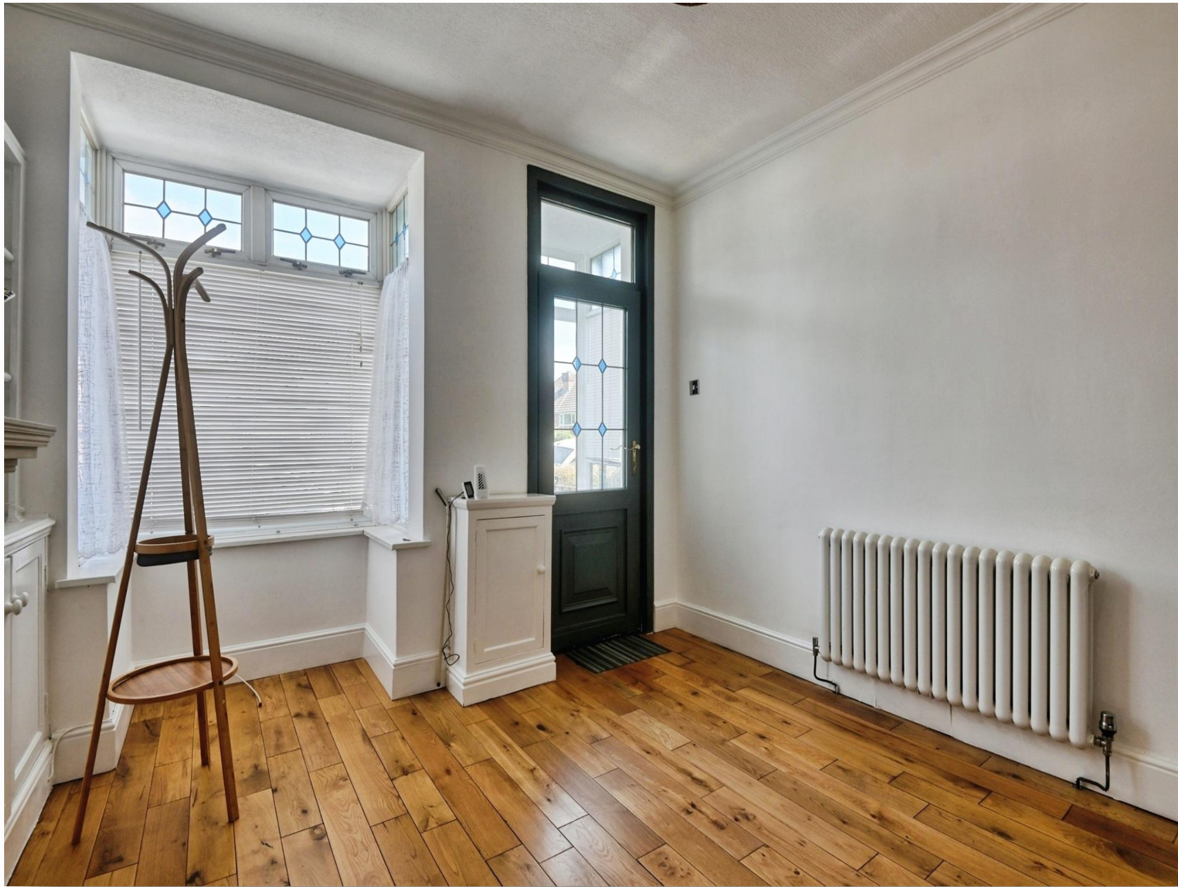
Fern Road, Birmingham B24 9DA