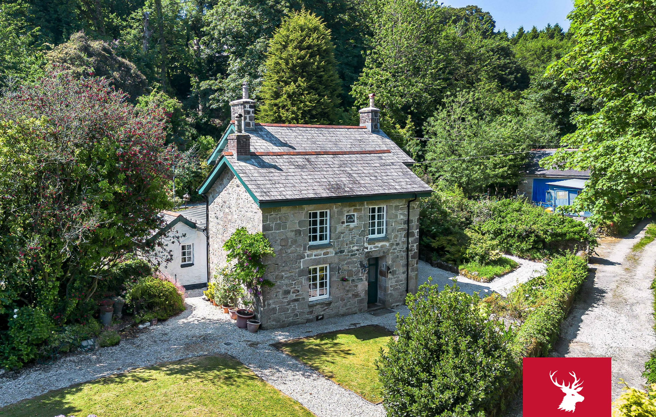
Wheal Martyn Cottage,