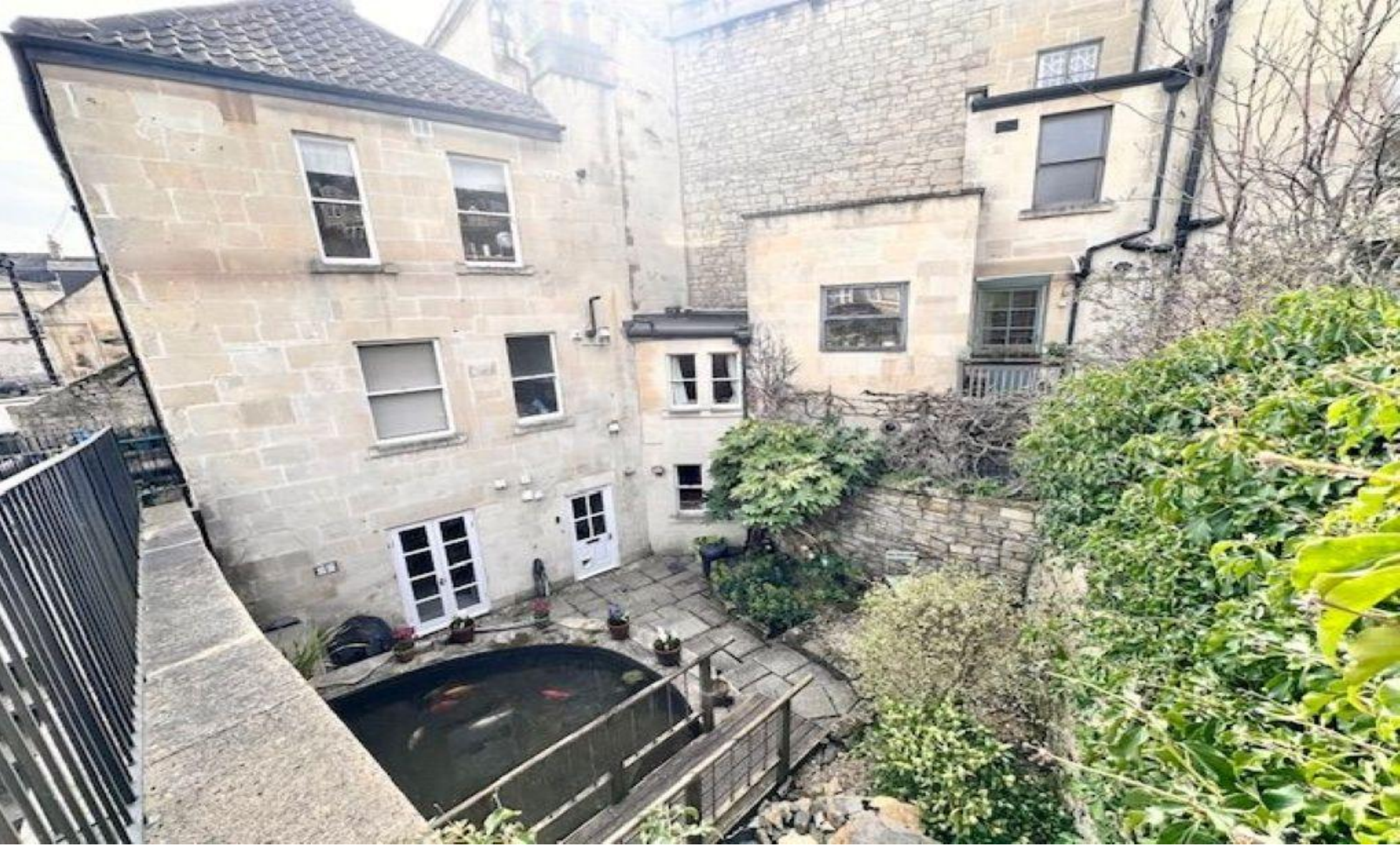
Upper East Hayes, Bath, BA1 6LN