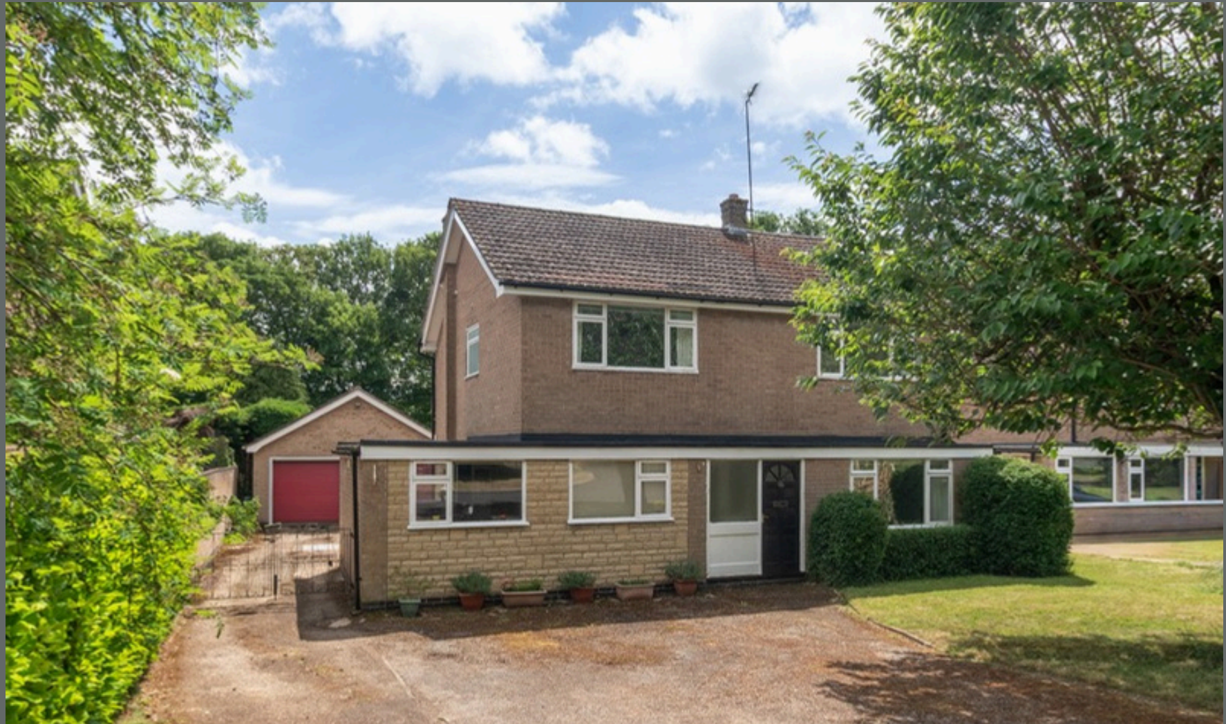
16 Kelthorpe Close Ketton