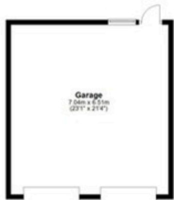
Ground Floor Approx 144.2 sq metres ( 1552.3 sq feet)