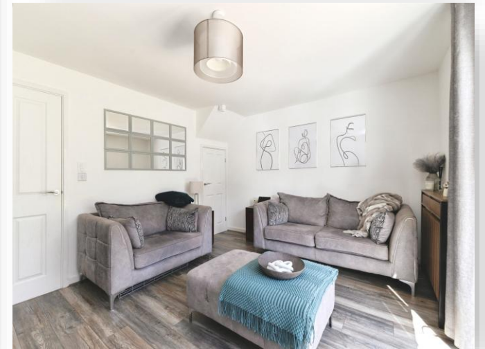
Maplewood Drive, Middlesbrough TS6 0GA