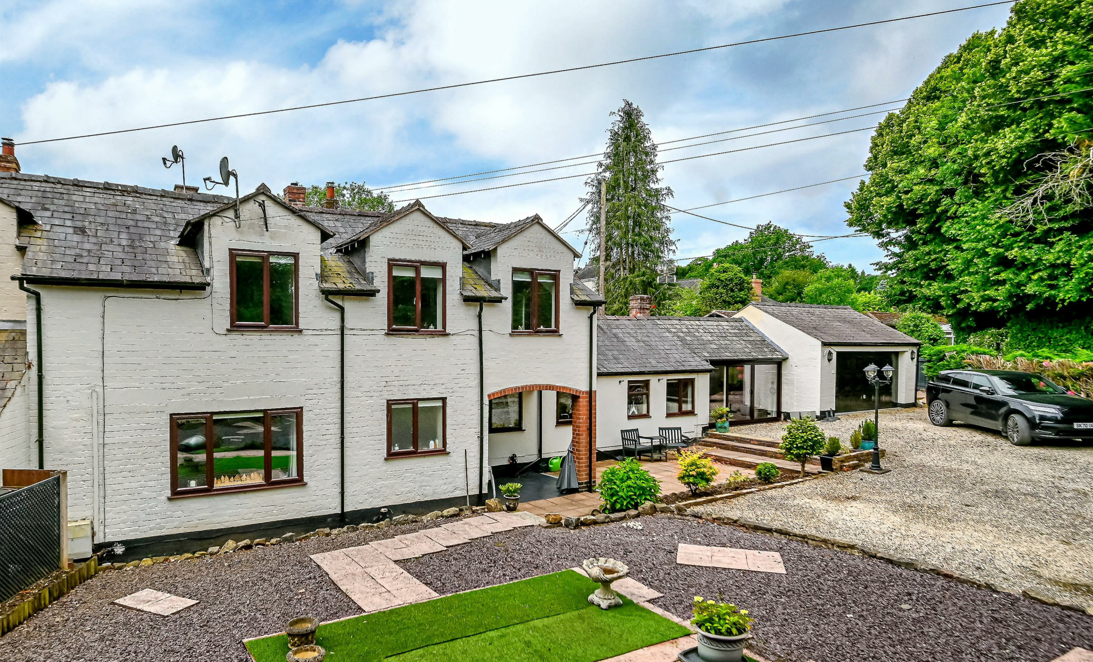
The Woodlands, Oldbury, Bridgnorth, Shropshire, WV16 5EE