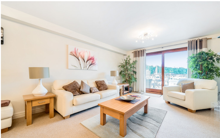
Open Plan Living Room