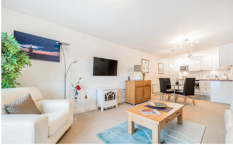
Open Plan Living Room and Kitchen