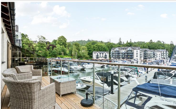
Balcony and View