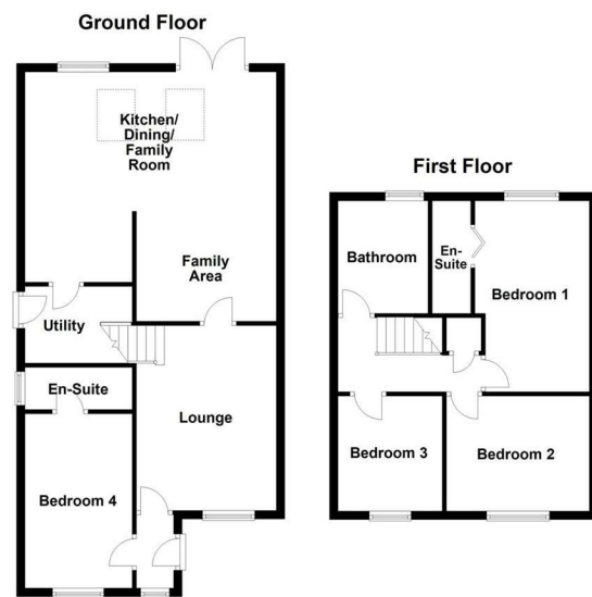
Not to scale. For illustrative purposes only