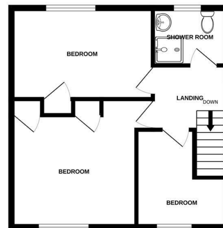
TOTAL FLOOR AREA : 980 sq.ft. (91.0 sq.m.) approx.

Whilst every attempt has been made to ensure the accuracy of the floorplan contained here, measurements of doors, windows, rooms and any other items are approximate and no responsibility is taken for any error, omission or mis-statement. This plan is for illustrative purposes only and should be used as such by any prospective purchaser. The services, systems and appliances shown have not been tested and no guarantee as to their operability or efficiency can be given. Made with Metropix ©2025