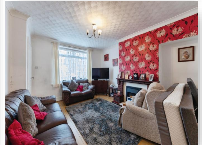
Mapleton Road, BIRMINGHAM B28 9RA