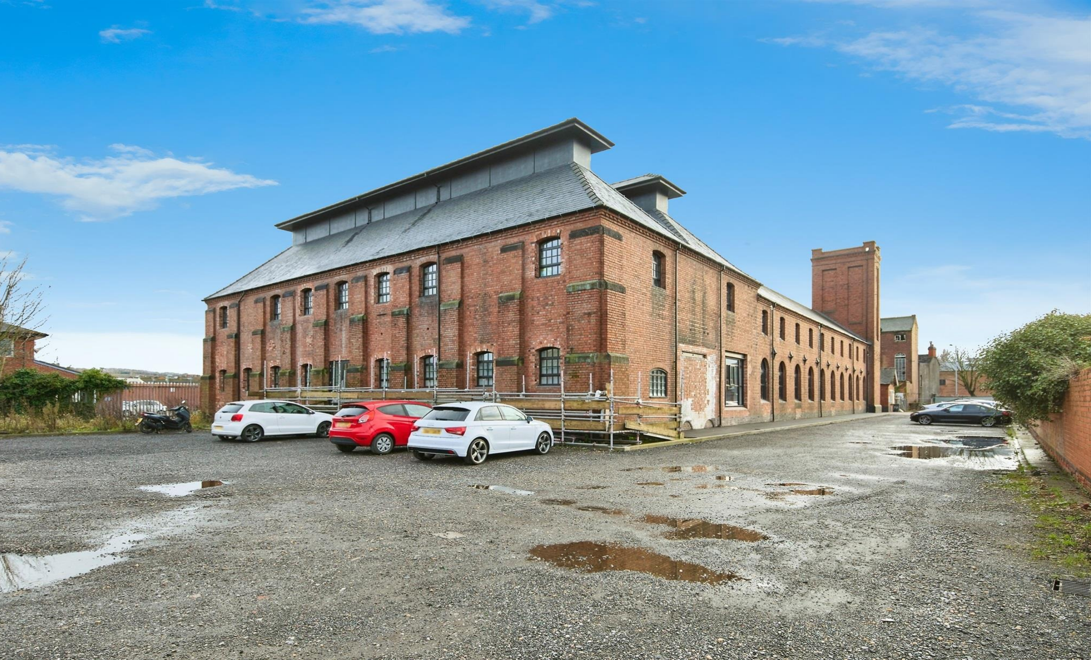
Plough Maltings, Horninglow Street, Burton-On-Trent