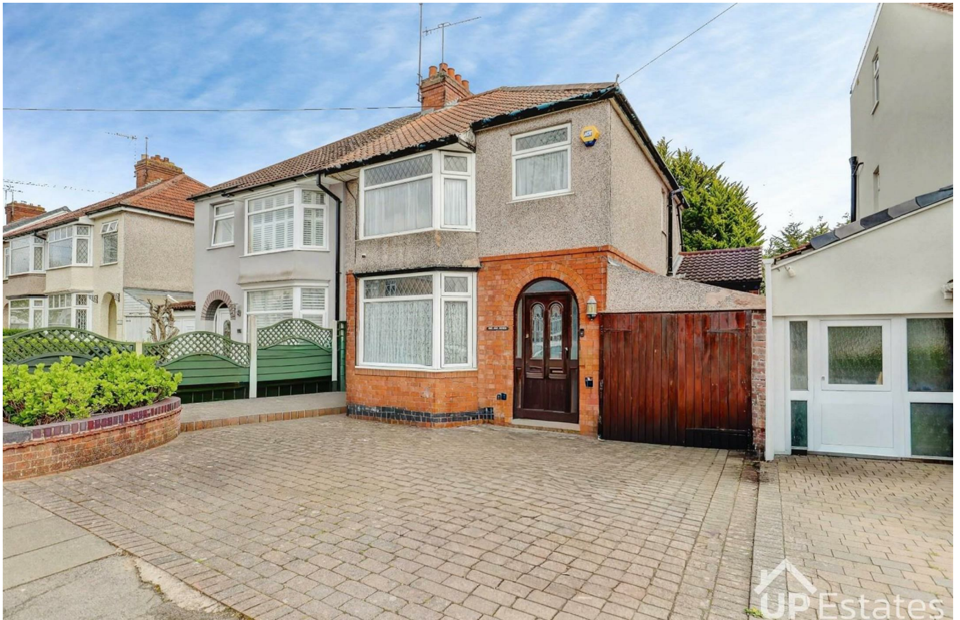
Wainbody Avenue South, Coventry