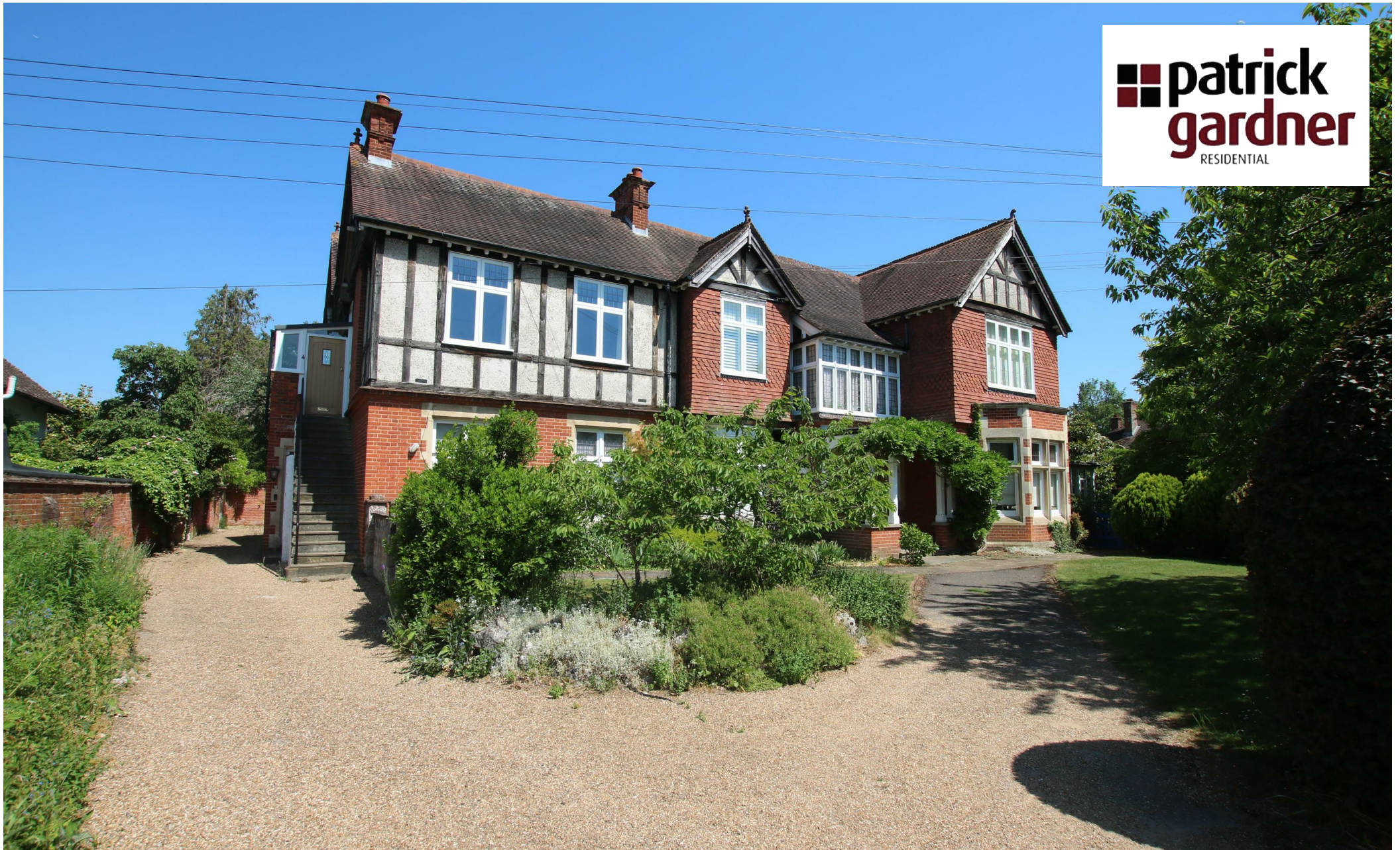
Flat 4 The Old Rectory, Fetcham, KT22 9QJ

Share of Freehold - Price Guide £375,000