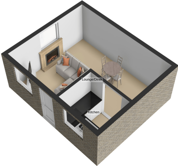
Ground Floor 203 sq.ft. (18.8 sq.m.) approx.