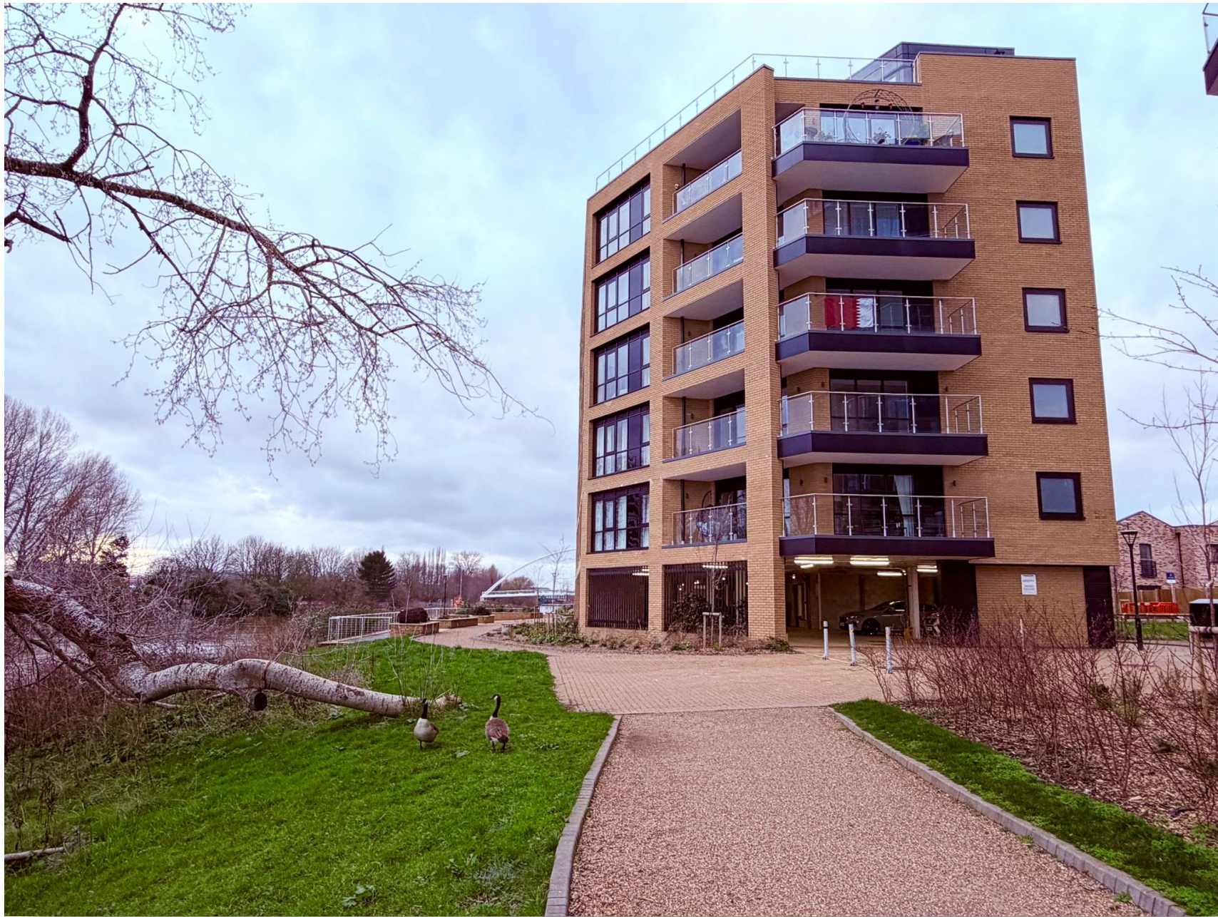
Yacht Club Place Trent Lane, Nottingham NG2 4RN