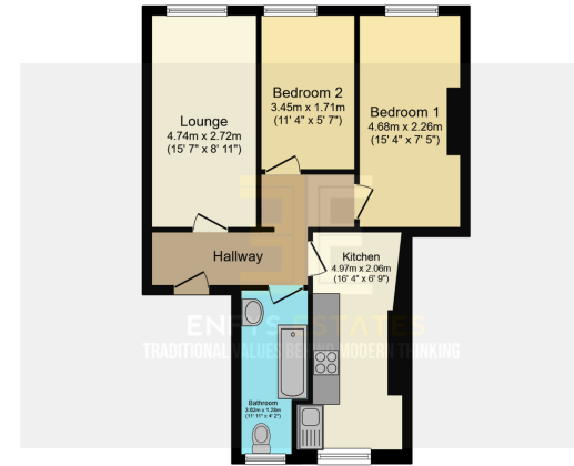
Floor Plan Floor area 53.3 sq.m. (573 sq.ft.)

Total floor area: 53.3 sq.m. (573 sq.ft.)