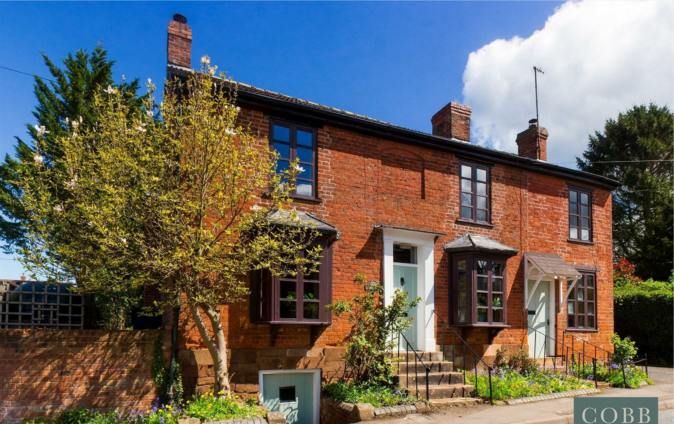
Red House and The Old Post Office, Luston, HR6 0EB Price £399,950