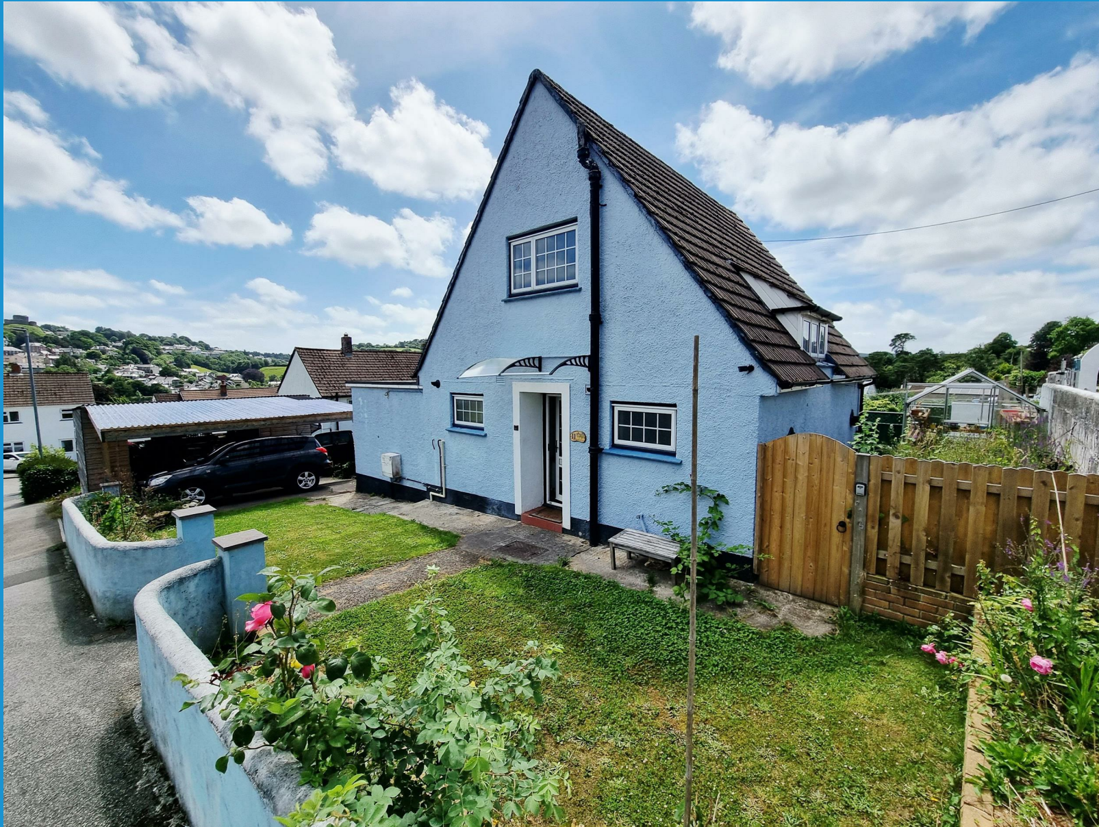
11 Broad Park Launceston | Cornwall