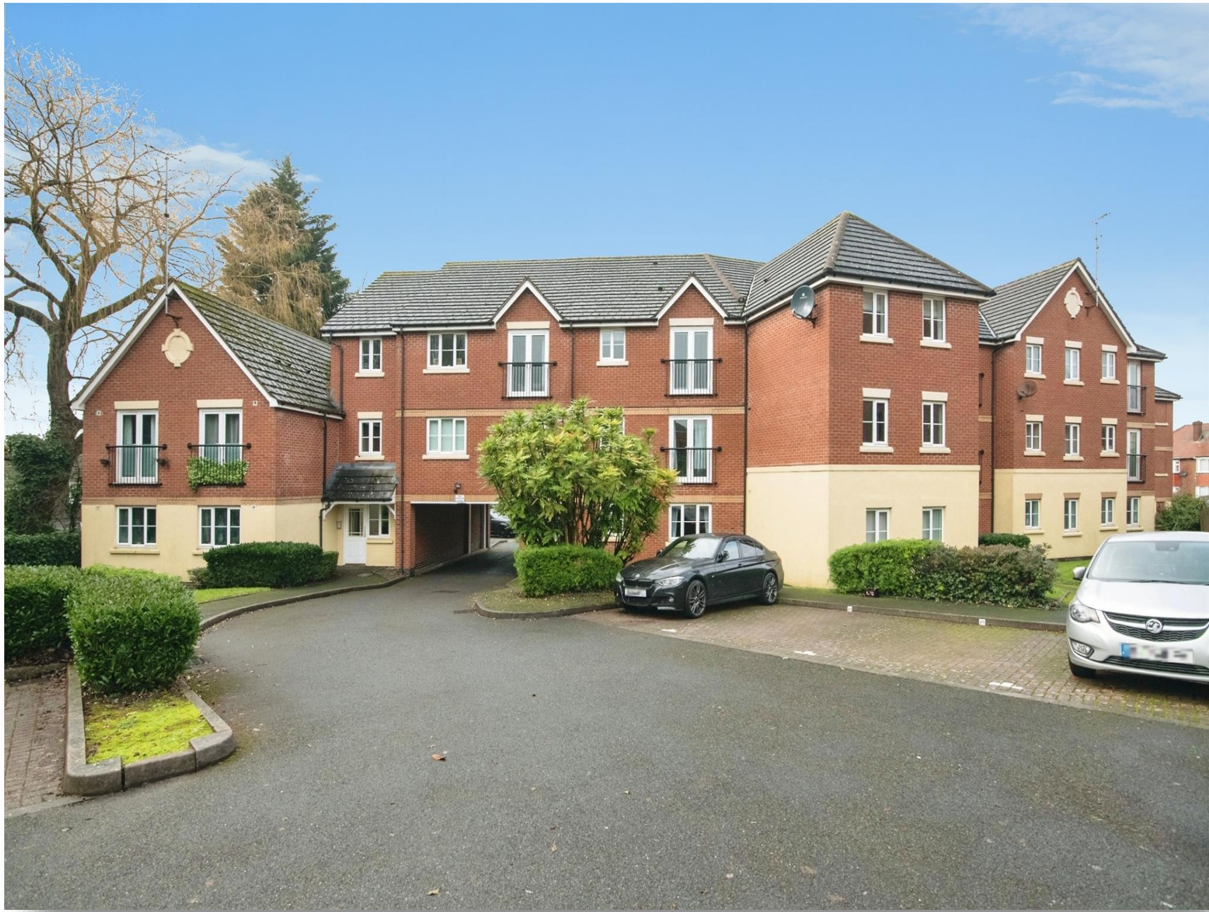
Asbury Court, Great Barr BIRMINGHAM B43 6QS