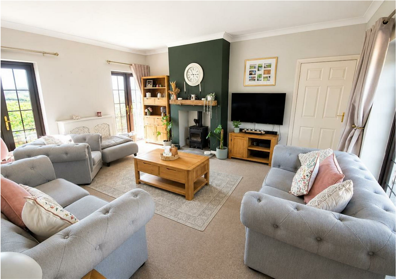
Primrose Gill Gill Head, Maryport