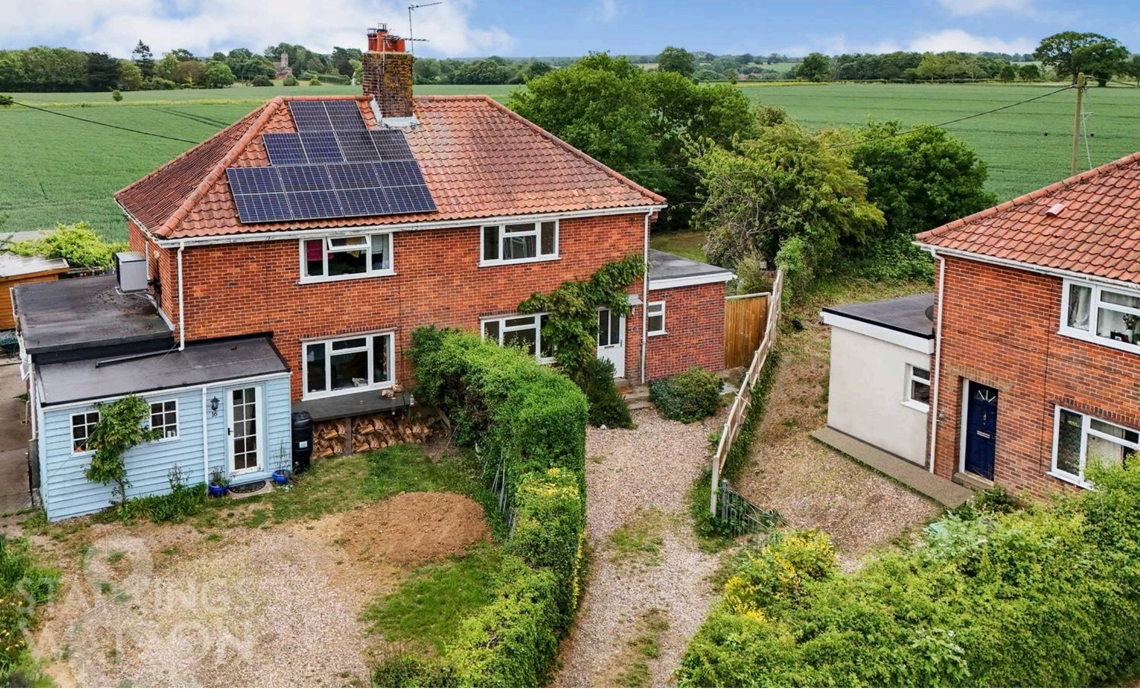
The Oaks, Rockland St. Mary - NR14 7HD