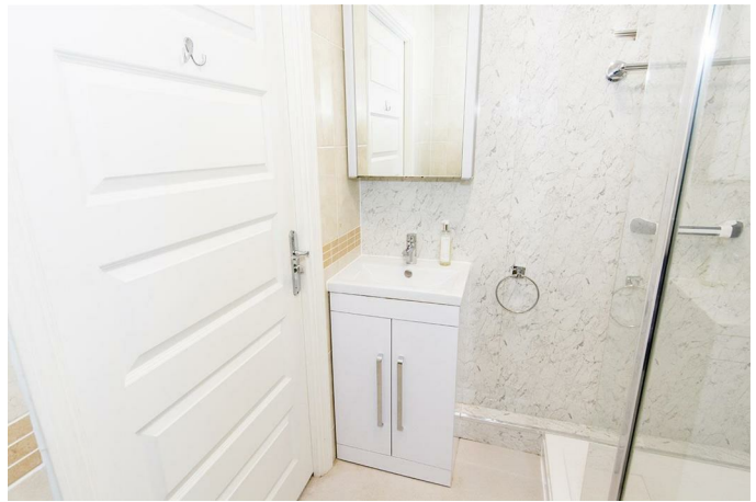
(Shower Room Photo Two)