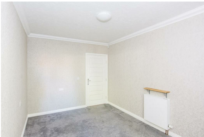
(Bedroom Two Photo Two)