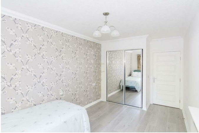
(Bedroom One Photo Two)