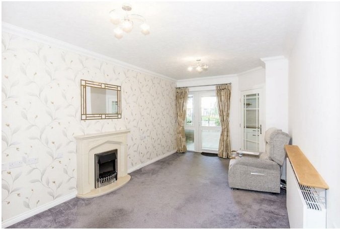
Lounge/Diner 19'0" x 10'4 (5.79m x 3.15m)

UPVC double-glazed window and rear entrance door providing direct access into the apartment via a private patio and the block's beautiful communal garden. Shelved linen cupboard off. Electric radiator. Television point. Telephone point. Coving to ceiling. Electric fire.