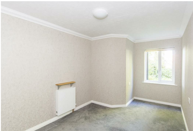
Bedroom Two 16'2" x 9'2" (4.93m x 2.79m)