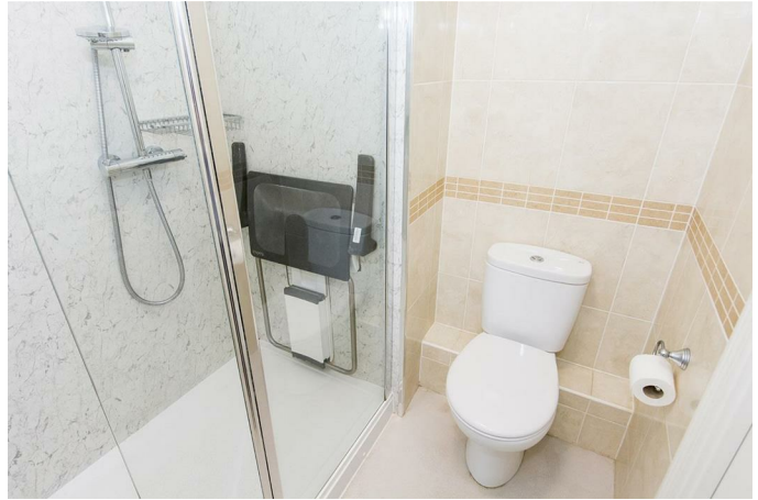
Shower Room 6'7" max x 5'4" max (2.01m max x 1.63m max)