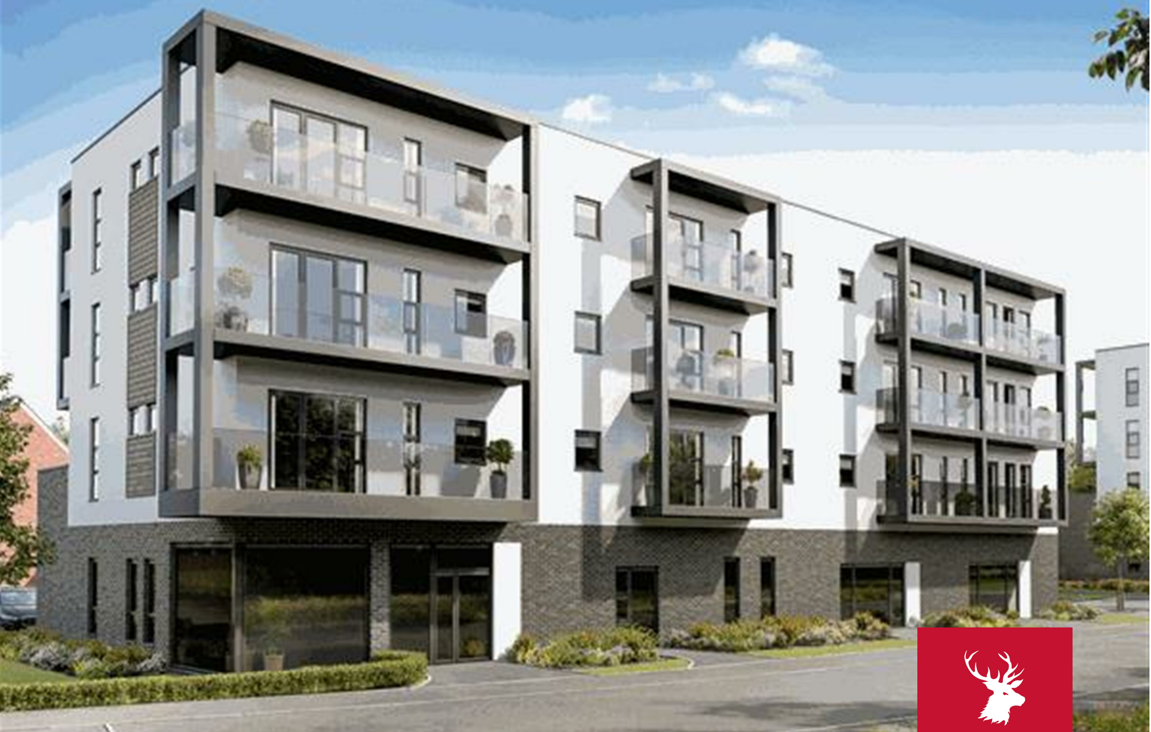
Apartment 705, Saltram Meadow