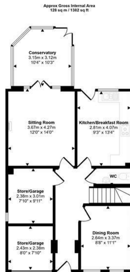
Ground Floor Approx 74 sq m / 799 sq ft