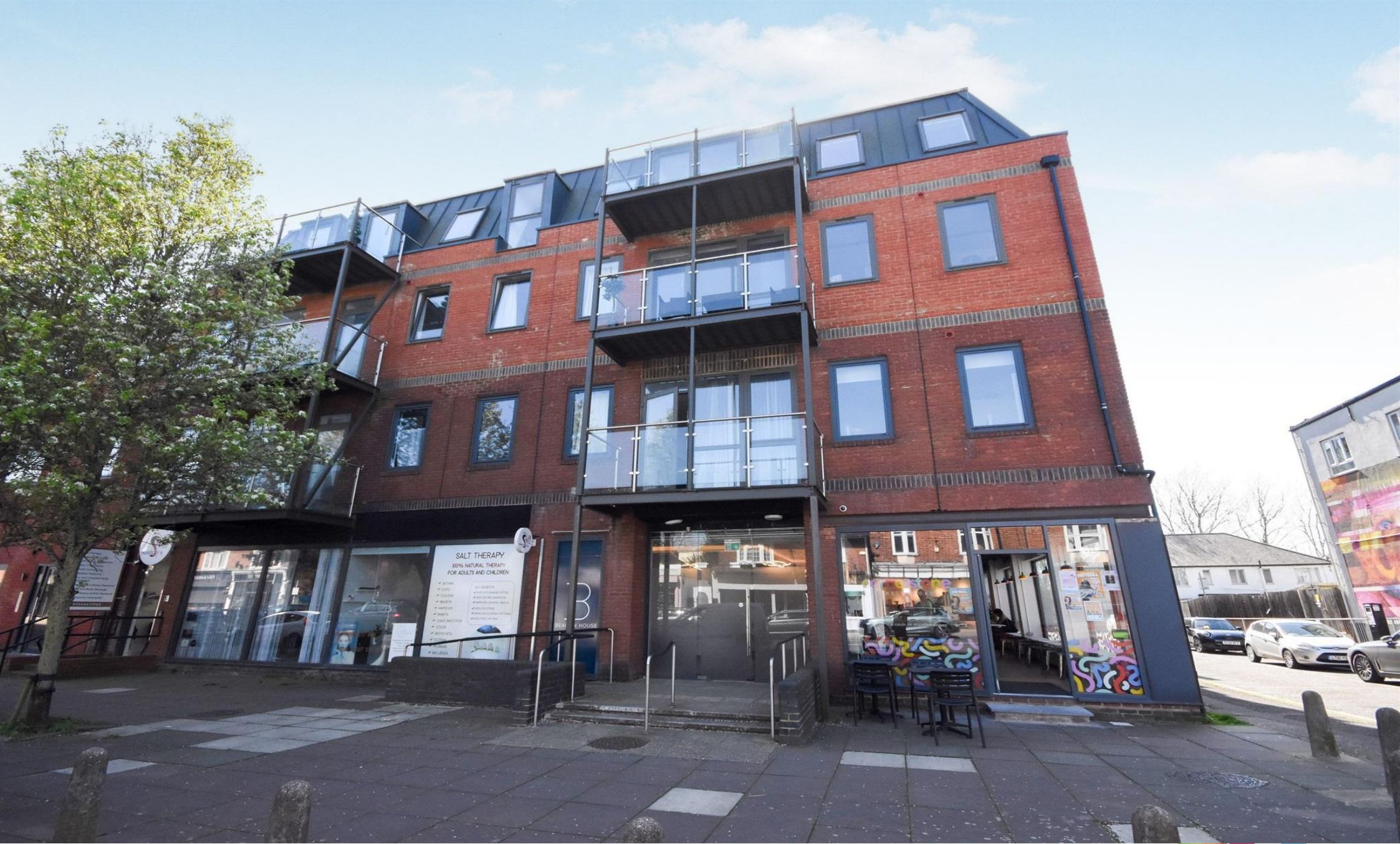
Beacon House, Rainsford Road, Chelmsford CM1 2XL