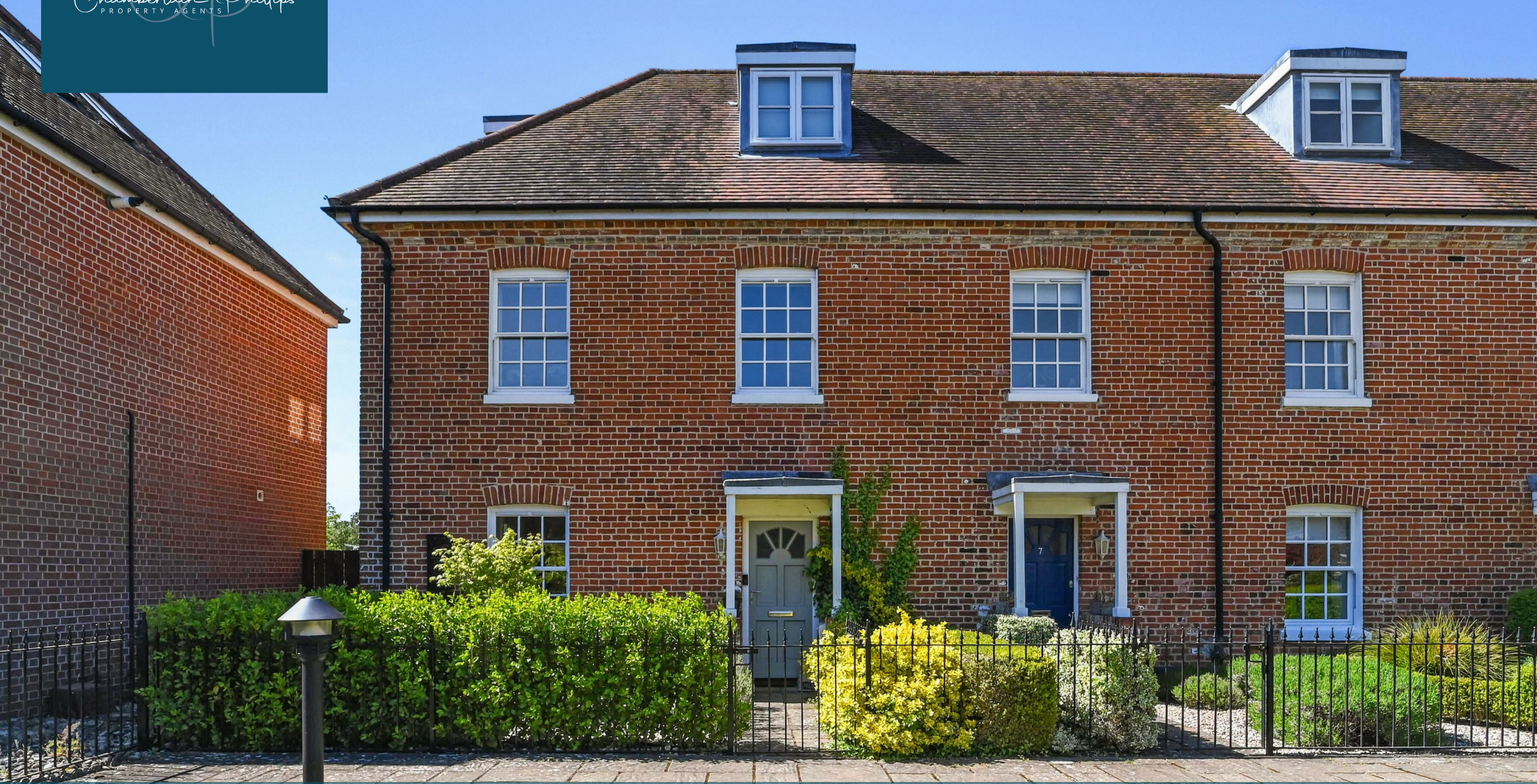
Chedworth Place, Tattingstone Guide Price £375,000