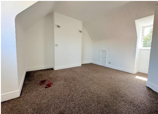
Bedroom Three:- 9' 4" x 6' 9" Into Window Recess (2.84m x 2.06m)

UPVC double glazed window to the rear elevation, radiator and flat/sloping ceiling.