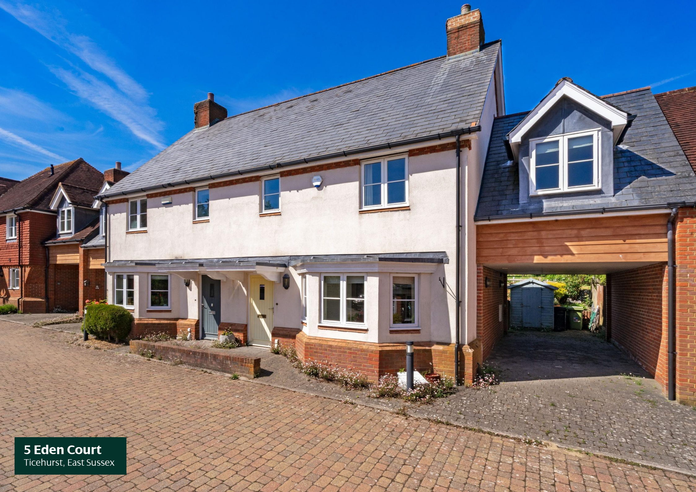
5 Eden Court Ticehurst, East Sussex