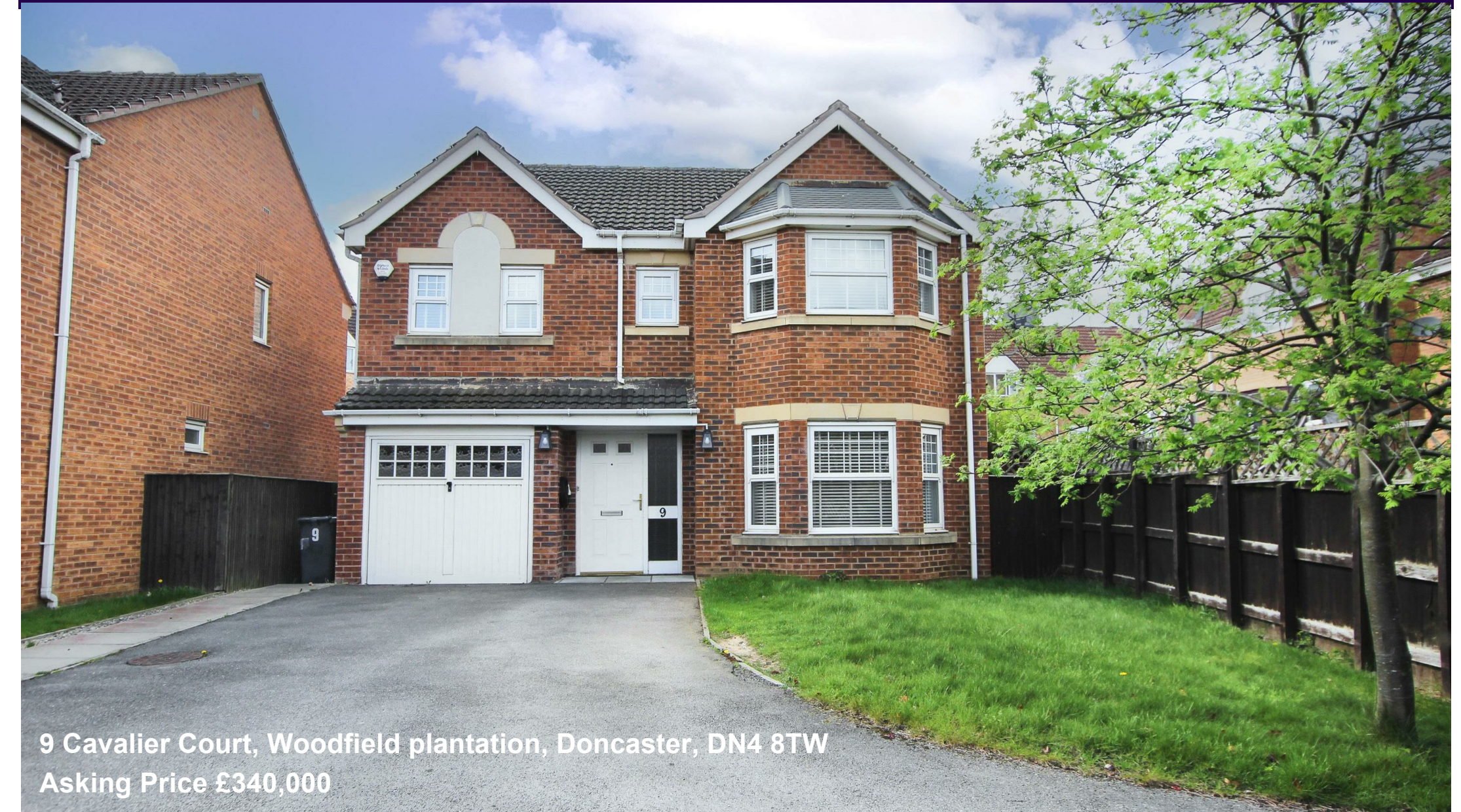
9 Cavalier Court, Woodfield plantation, Doncaster, DN4 8TW Asking Price £340,000