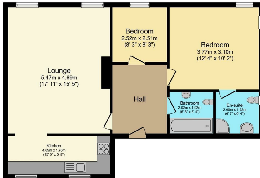
Floor Plan Floor area 75.4 sq.m. (812 sq.ft.)

Total floor area: 75.4 sq.m. (812 sq.ft.)