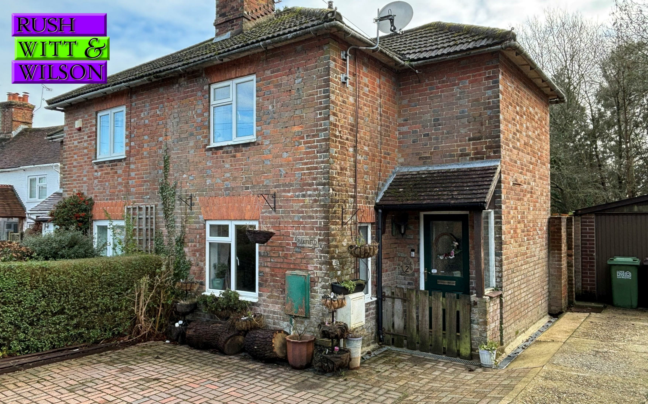
2 Oakfield Cottages Cackle Street, Rye, East Sussex TN31 6DX Guide Price £350,000 Freehold