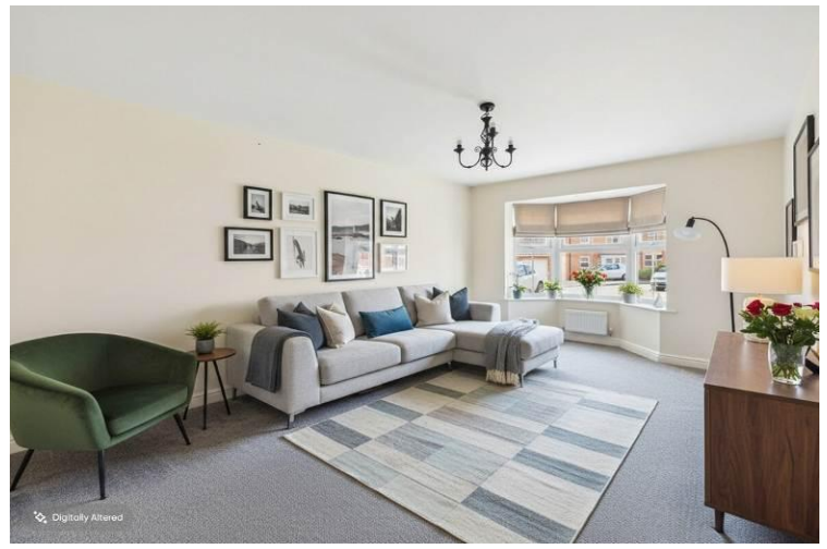
Lounge - Virtually Staged