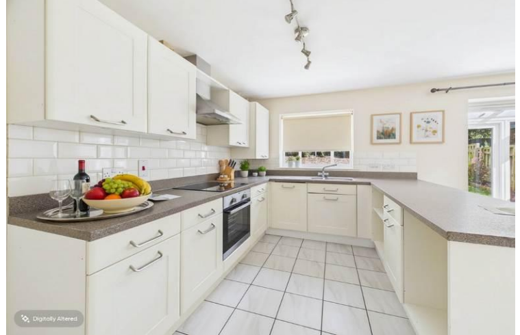
Breakfast Kitchen - Virtually Staged