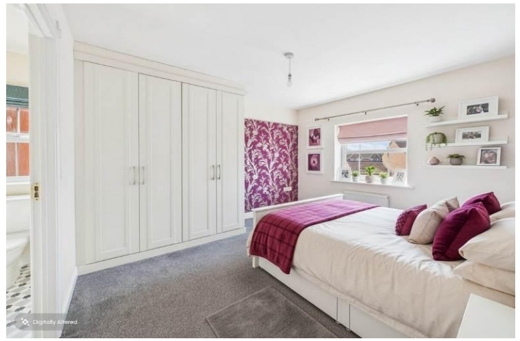
Bedroom 1 - Virtually Staged