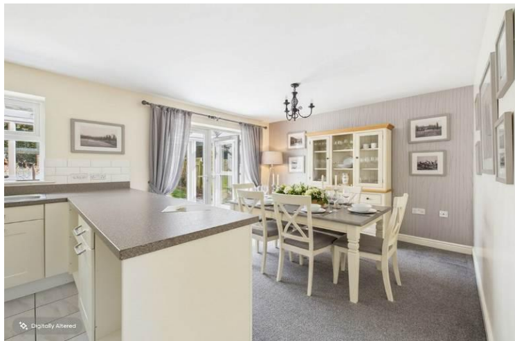
Breakfast Kitchen - Virtually Staged