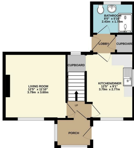
1ST FLOOR 307 sq.ft. (28.5 sq.m.) approx.